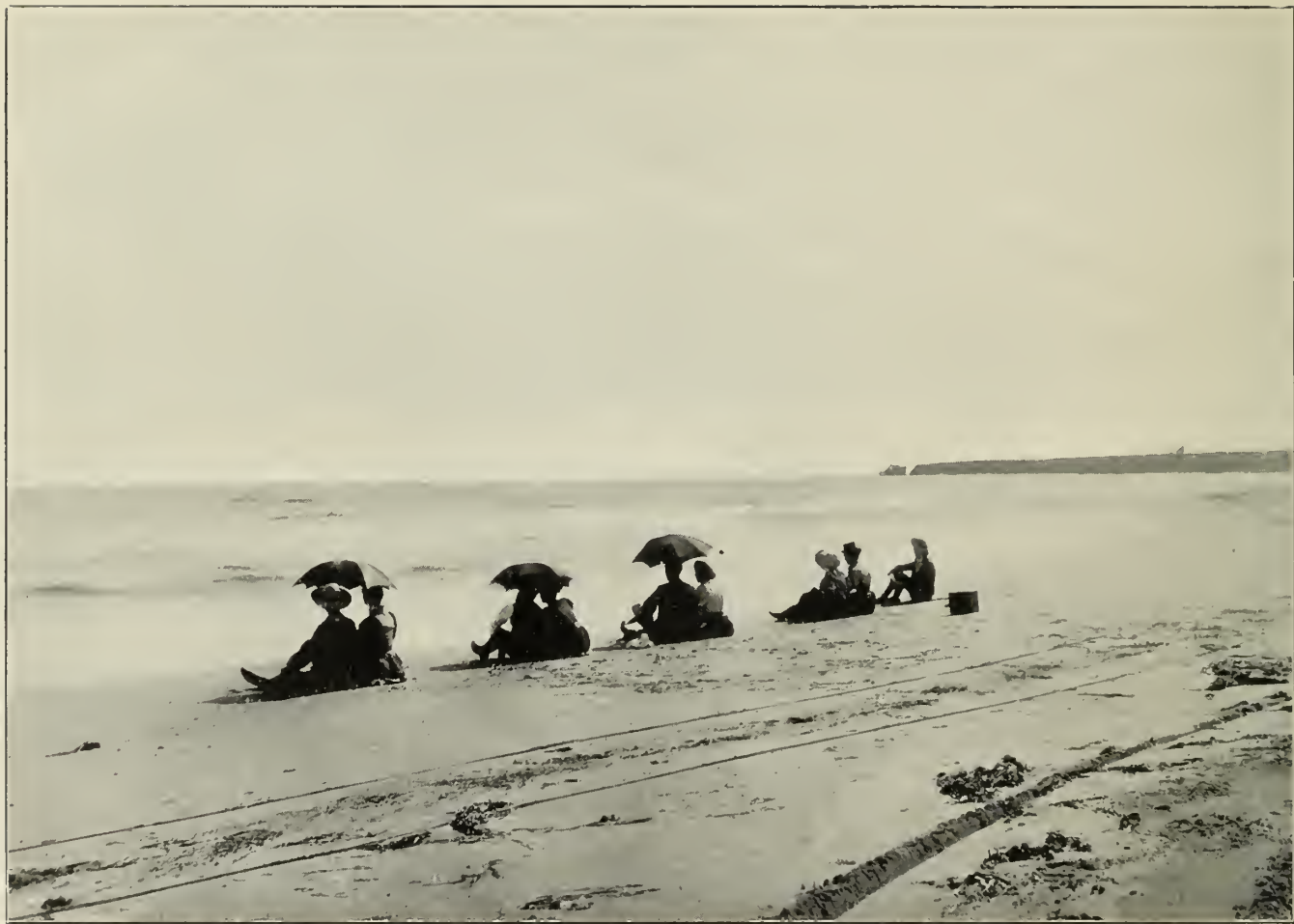
THE ISLAND'S LOVELY BEACHES—AT CAVENDISH